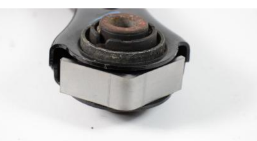
Figure 1 - Showing Fitting Tool in similar arm